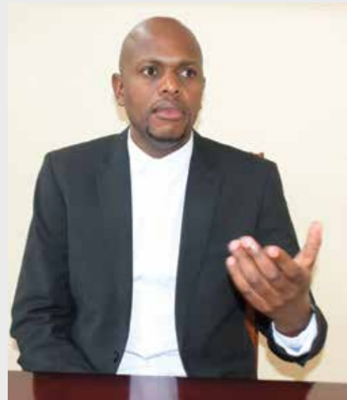
Mohokare Local Municipality Mayor, Teboho Mochecheba