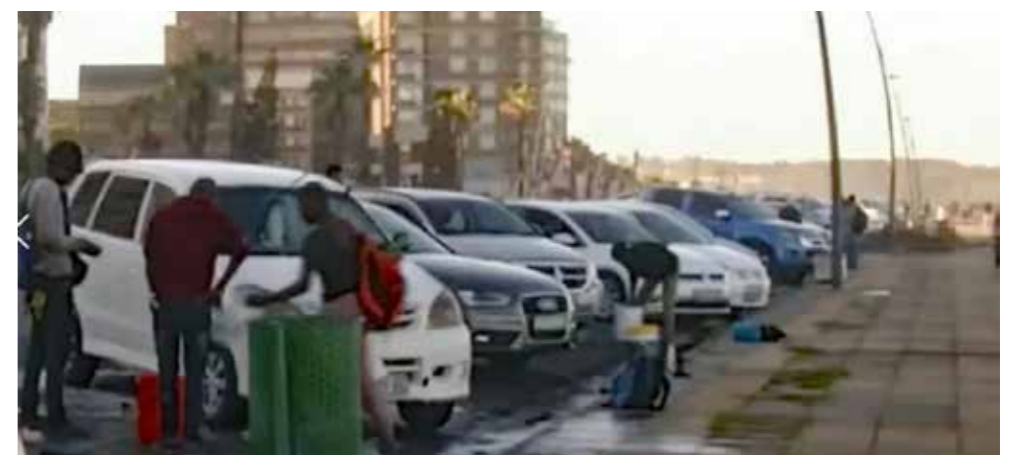
Unemployed youth.

South Africa's latest Quarterly Labour Force Survey (QLFS) shows that the North West and Eastern Cape are the only two provinces where more people are unemployed than working.