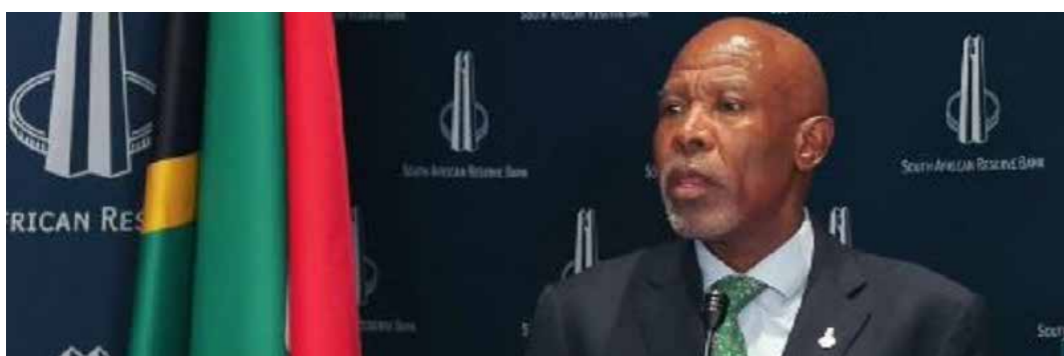
Reserve Bank Governor Lesetja Kganyago.

Reserve Bank Governor Lesetja Kganyago has announced that the repo rate will be cut by 25 basis points – meaning that the prime lending rate will decline to 10.25%.