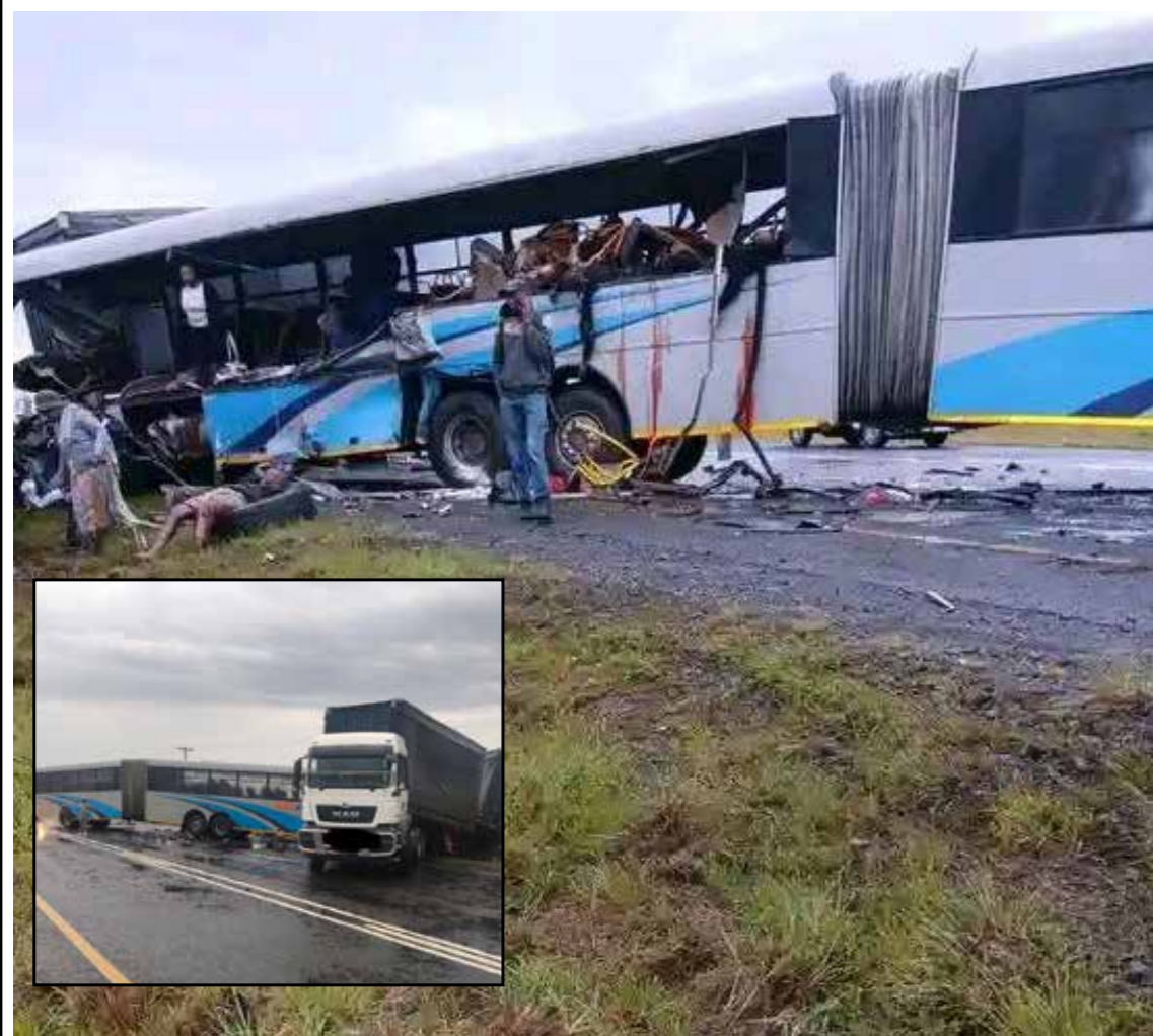
N8 Bus and Truck Collision Leaves 11 Dead.