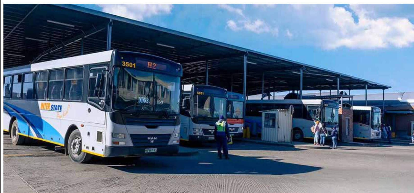
Interstate Bus terminal.

The N8 crash involving an Interstate Bus Line (IBL) vehicle and a privately-owned truck between Botshabelo and Bloemfontein on Saturday 15 November is the third large-scale incident here in the last eight years. The number of deceased from the latest accident exceeds those in 2017 and 2022 — in which eight and nine passengers were killed, respectively.