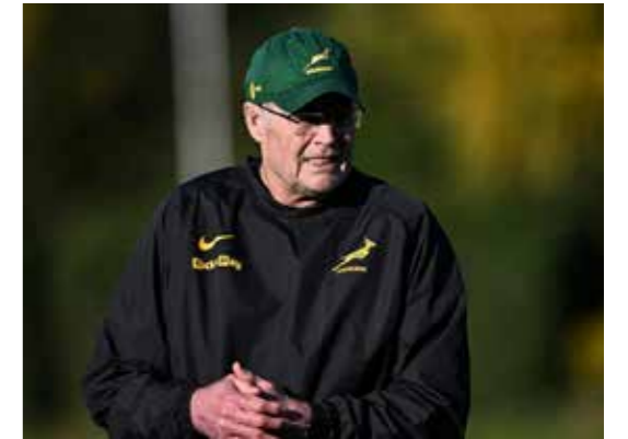
Springbok coach Rassie Erasmus.

Rassie relies on his experienced core for Boks' big day in Dublin