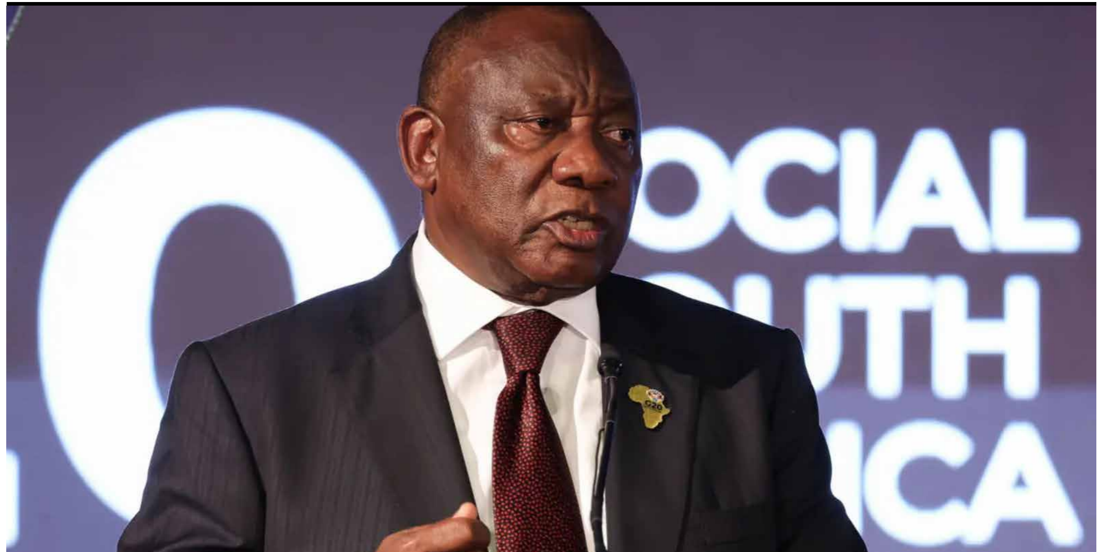
President Cyril Ramaphosa addresses the closing of the G20 Social Summit at the Birchwood Hotel in Boksburg.

J OHANNESBURG - In an 11th-hour about-turn, the United States has told South Africa it wants to take part in this weekend's G20 summit in Johannesburg, President Cyril Ramaphosa said Thursday.