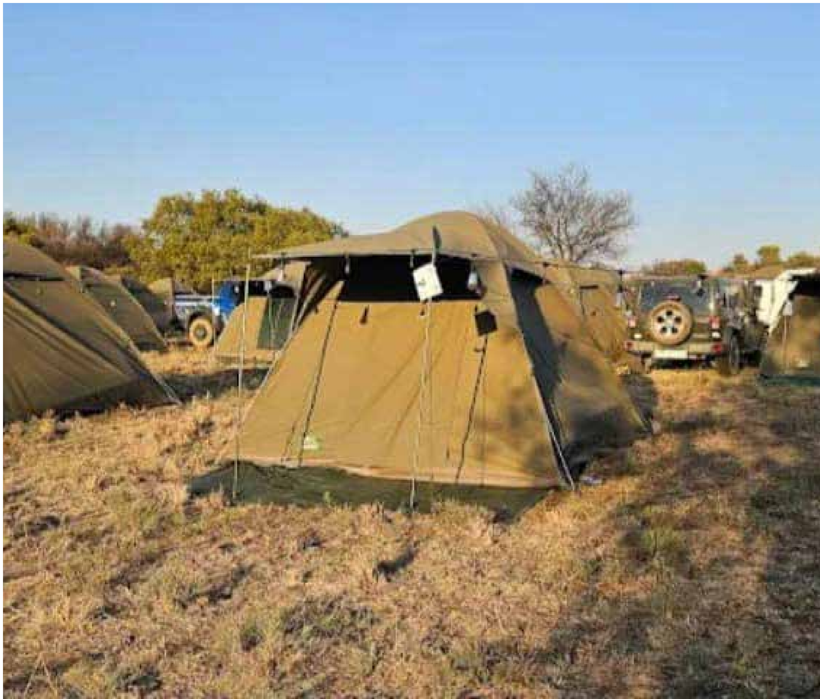
DESTEA hosts a Free State Camp-out experience.