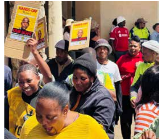
Mohokare Residents Halt Council Sitting Over Move to Remove Mayor.

Residents Disrupt Council, Mayor Survives Removal Bid