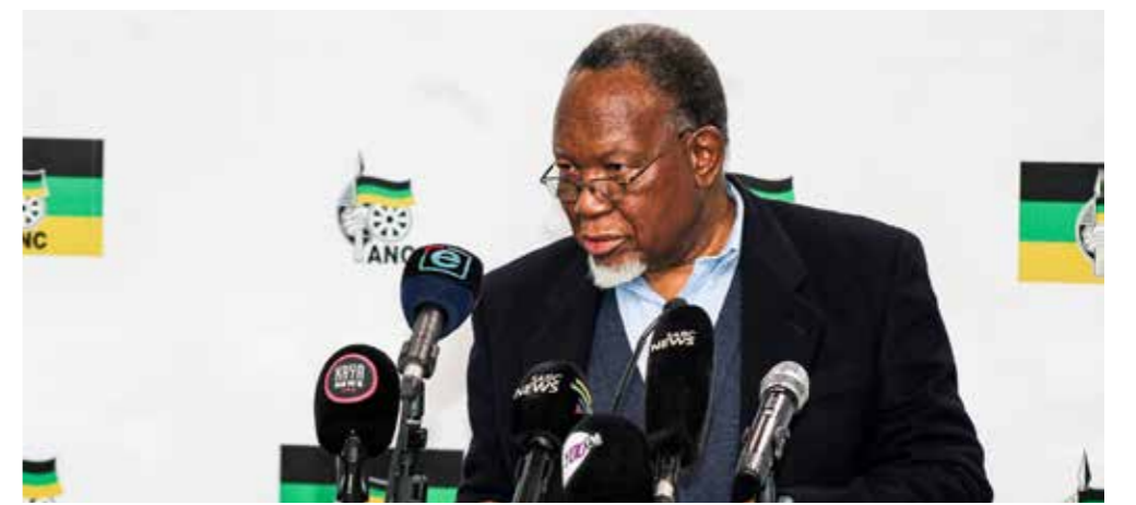
ANC Electoral Committee Chairperson, Kgalema Motlanthe.